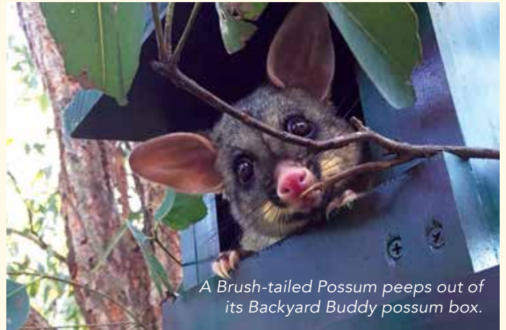
A Brush-tailed Possum peeps out of its Backyard Buddy possum box.