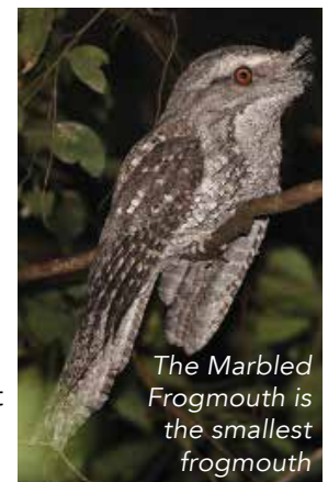
The Marbled Frogmouth is the smallest frogmouth