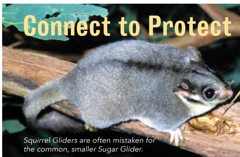
Squirrel Gliders are often mistaken for the common, smaller Sugar Glider.

Targeted interventions will focus on preventing further population decline and ensuring the long-term persistence of threatened species across the Gillindich-Wyangala landscape.