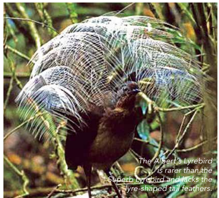
The Albert's Lyrebird is rarer than the Superb Lyrebird and lacks the lyre-shaped tail feathers.

identification and control, native plant propagation and bush regeneration techniques.