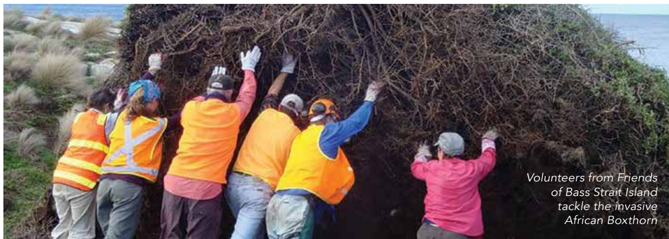
Volunteers from Friends of Bass Strait Island tackle the invasive African Boxthorn