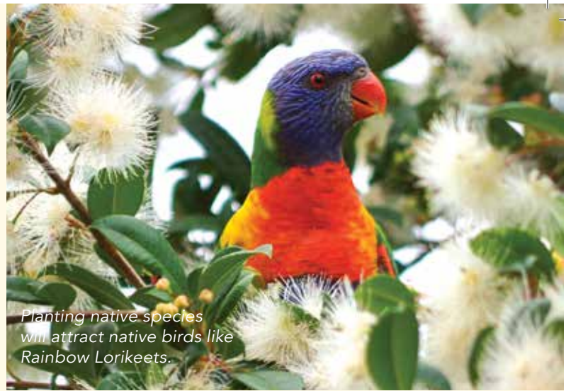
Planting native species will attract native birds like Rainbow Lorikeets.

Find out more about your Buddies: www.facebook.com/backyardbuddies