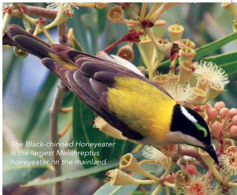
The Black-chinned Honeyeater is the largest Melithreptus honeyeater on the mainland.

Through a program of engagement with the local community, conservation agencies, researchers and landholders in the Southwest Slopes, the